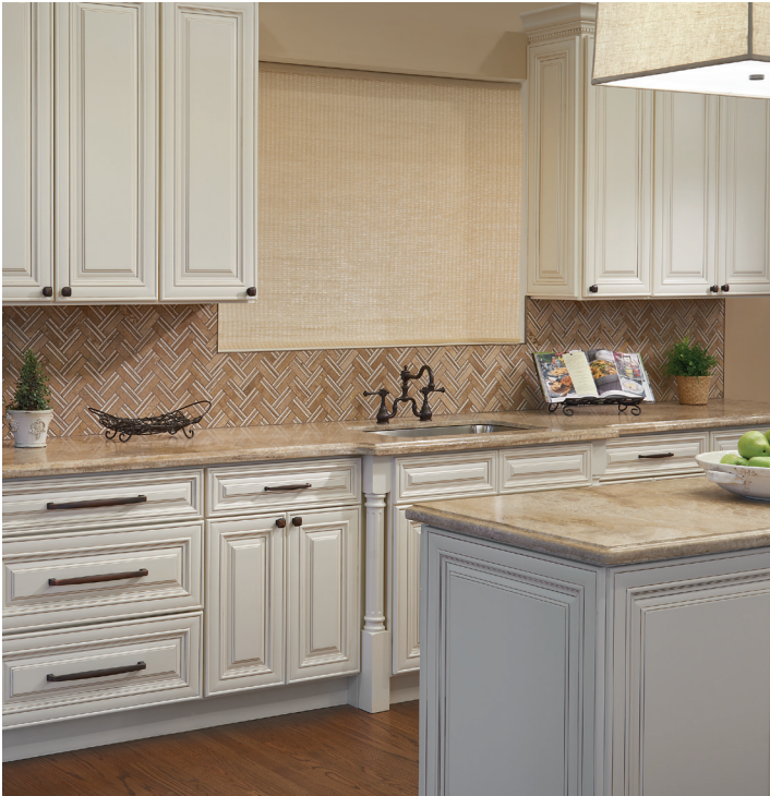
▲ CHARLESTON ANTIQUE WHITE