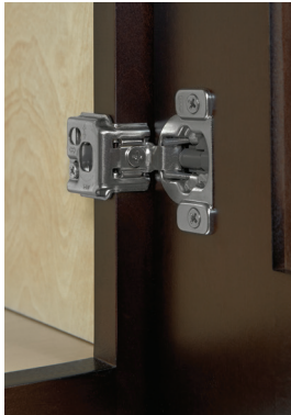
SOFT CLOSE HINGES

Operating from our home base in Mokena, Illinois, Aline International LLC is focused on providing our customers throughout North America with high-quality kitchen cabinetry at a great price. Our strong customer-oriented philosophy is driven by an unwavering commitment to delivering excellence in products and service. We promise to meet or exceed all professional standards of the cabinet industry by incorporating the highest-grade materials and maintaining an uncompromising level of quality control of our products.