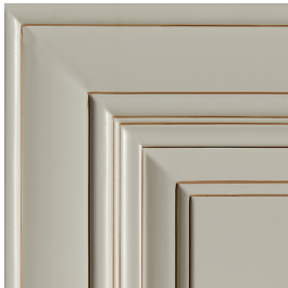
CHARLESTON ANTIQUE WHITE