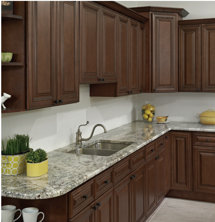
▲ CHARLESTON SADDLE