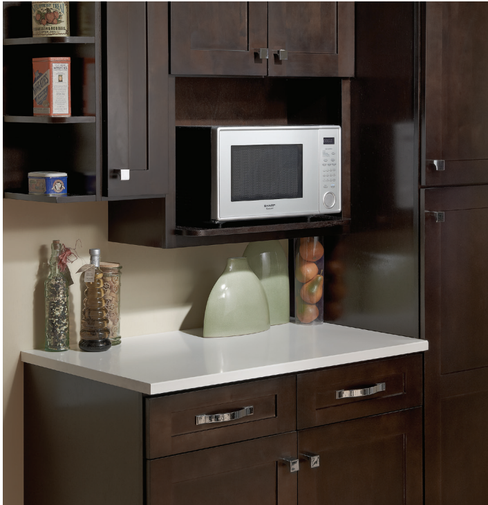
▲ ESPRESSO (ALSO SHOWN ON COVER)