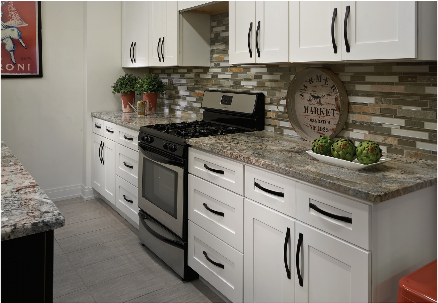
▲ SHAKER WHITE